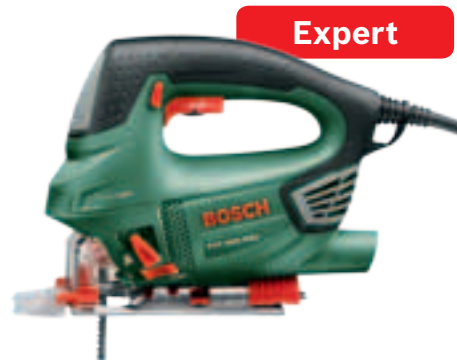
PST 900 PEL