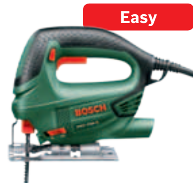
PST 700 E