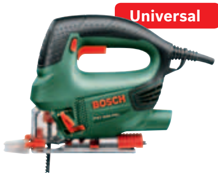
PST 800 PEL