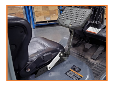
MH-3001 Universal Forklift Keyboard Mount No drilling universal mount clamps securely underneath forklift seat rail.