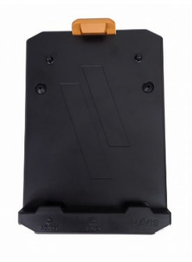
C-KBM-201 Keyboard Mount Quickly dock and undock your Havis Rugged Keyboard with this equally rugged mount. No tools or hardware required.

Havis offers a wide variety of accessory products specifically for use with our Rugged USB Keyboards. For more information or to order, please visit www.havis.com .