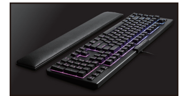
Compatible with Optional Magnetic Palm Rest *Sold separately