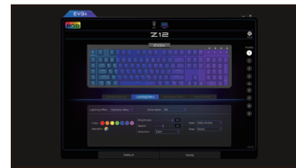
EVGA Unleash RGB Software: Customize 5 Zone RGB Lighting