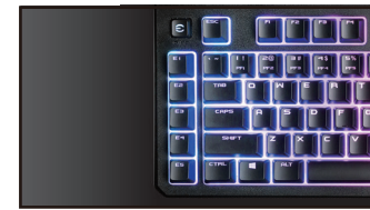
Dedicated Macro Keys and Game Mode Key