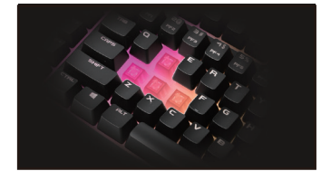
Cherry MX Style Keycaps Compatible