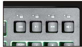
Dedicated Media Keys